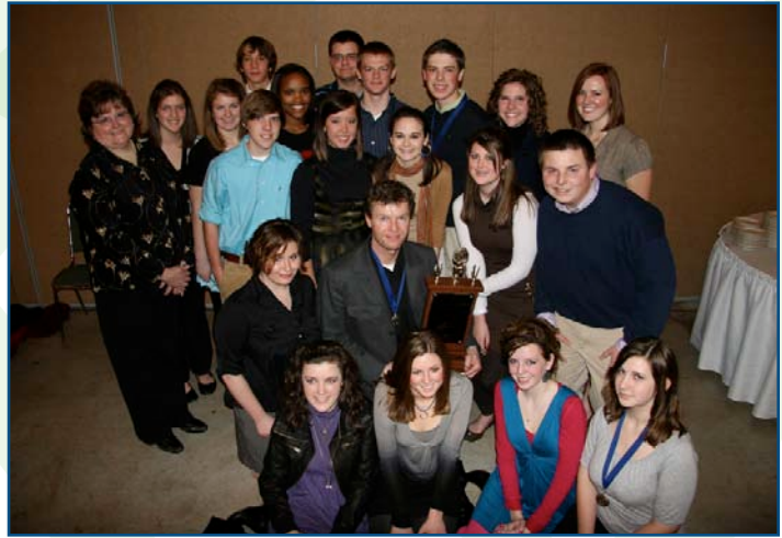
Cast of "All in the Timing".

The entire company watched each show and became quite in tune with the adjudicators. They soon learned what the adjudicators would be critical of or let slide. In many instances, the students were more critical of a performance than the adjudicator's oral notes. This showed that the students were not just participating in a festival with a production, but they were learning. That is why these festivals are so important in the education process. The cast and crew will take many memories of this even with them.