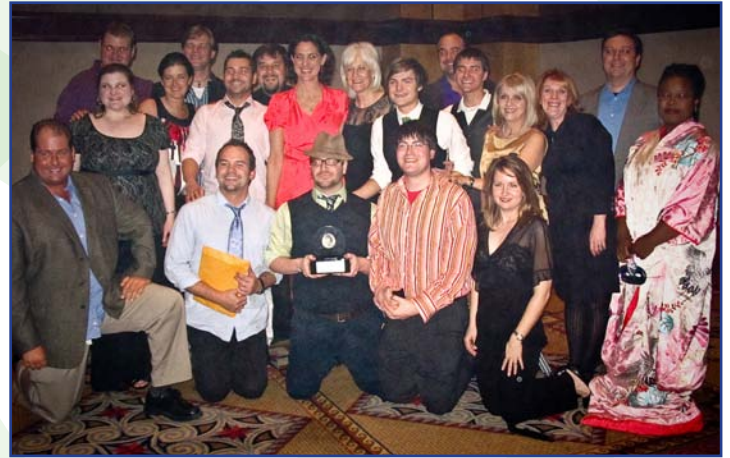
The fans, cast and crew of Starkville Community Theatre's Catfish Moon celebrate the theatre's Best Production Award.

Productions held at Natchez Little Theatre where we bussed in over 400 students from area schools to see these wonderful productions.