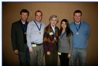
Community Theatre All Star Cast Members.