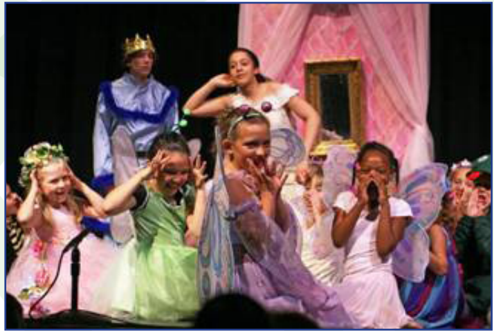
Cast of Once Upon a Mattress

The WINGS Performing Arts Program at the Lynn Meadows Discovery Center in Gulfport is a nationally recognized program for elementary through high school students residing on the Mississippi Gulf Coast. In its ninth year, WINGS expands a child's world through high quality programming in the arts and humanities. Approximately 500 children across the Gulf Coast,